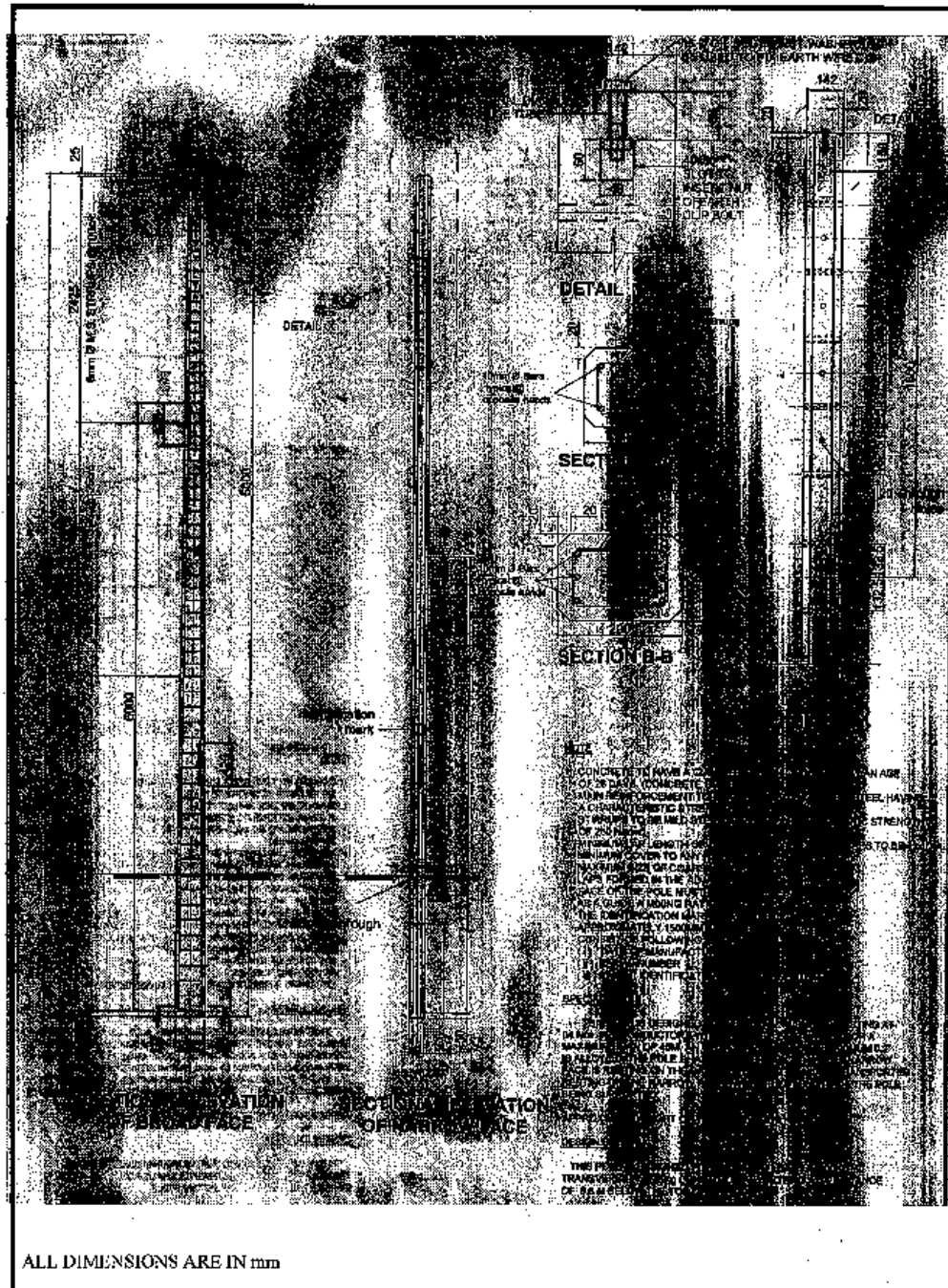
Figure: 8.3 m / 100 kg REINFORCED CONCRETE POLE